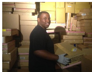
D.W. received employment support services and now has a full time job at $11 an hour with benefits.

The 2015 House Study Committee recommended the creation of Georgia's Employment First Council.