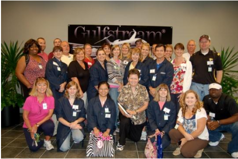
Ga STEM Institute @ Gulfstream

The Georgia Department of Education recently completed the 2 nd Annual Georgia STEM Institutes. The first one was hosted by Gulfstream in Savannah where teachers were exposed to a variety of STEM industries and career possibilities for students including NOAA, Georgia Power, The Coastal Gardens, and St. Joseph's Candler Hospital. The second was conducted in Atlanta where teachers visited Lockheed Martin, CryoLife, Quality Technology Services, the Georgia Tech Food Processing Lab, the GSU Bio-Bus, SPSU and heard speakers from Texas Instruments, VEX Robotics, KSU, Women In Technology, and The U.S. Dept. of Labor.