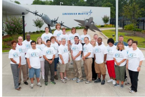
Ga STEM Institute @ Lockheed Martin