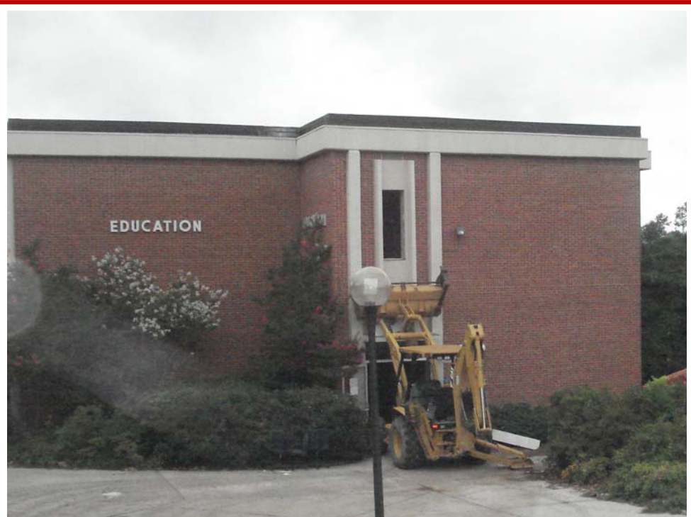
A bulldozer is about to begin the demolition of the Education Building, the former home of the RESA offices.

The RESA offices are now located in the Learning Support Building on the first floor, room 126. This building houses the auditorium and is next to the newly built Jones Building. Plans are for RESA to be there for approximately two years.