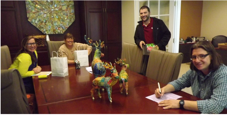
Above: NC Veterinary Medical Board candidates join NCVMA!