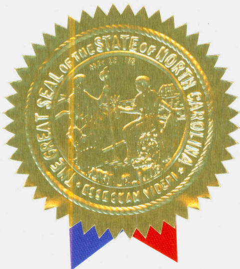
BEVERLY EAVES PERDUE

NOW, THEREFORE, I, BEVERLY EAVES PERDUE, Governor of the State of North Carolina, do hereby proclaim November 2011, as " SAFE PET TRAVEL AWARENESS MONTH " in North Carolina and urge our citizens to commend this observance.