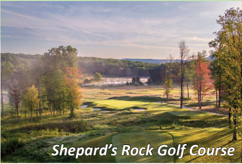
Shepard's Rock Golf Course

Golf Scramble Tuesday, July 14 1:00 PM Shot Gun Start