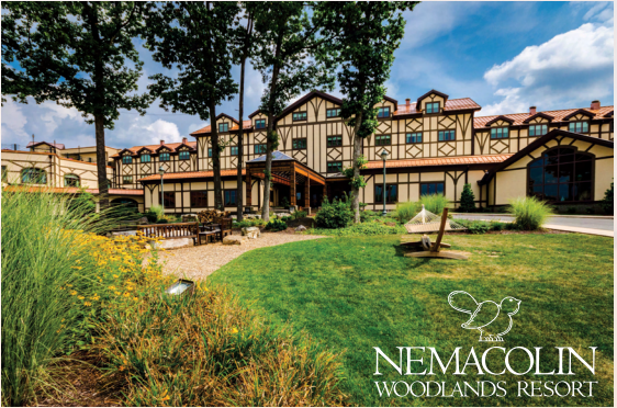
NEMACOLIN WOODLANDS RESORT

The deadline for room reservations is June 5, 2020 . All room reservations must be made with Nemacolin Woodlands Resort. Go to www.nemacolin.com . Click on the "BOOK" button in the top right corner. Enter the dates of your stay and use group code 10C78J . All available rooms will be displayed. If you want to make reservations over the phone, upgrade your room or add additional nights outside of the group block, please call 866-344-6957. Dial option #1 for reservations and listen to the prompts from there to speak with an agent.